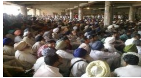
Addressing the Local issues