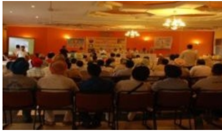
Seminar and Workshops