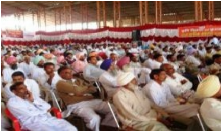
Farmers Fair and Meetings